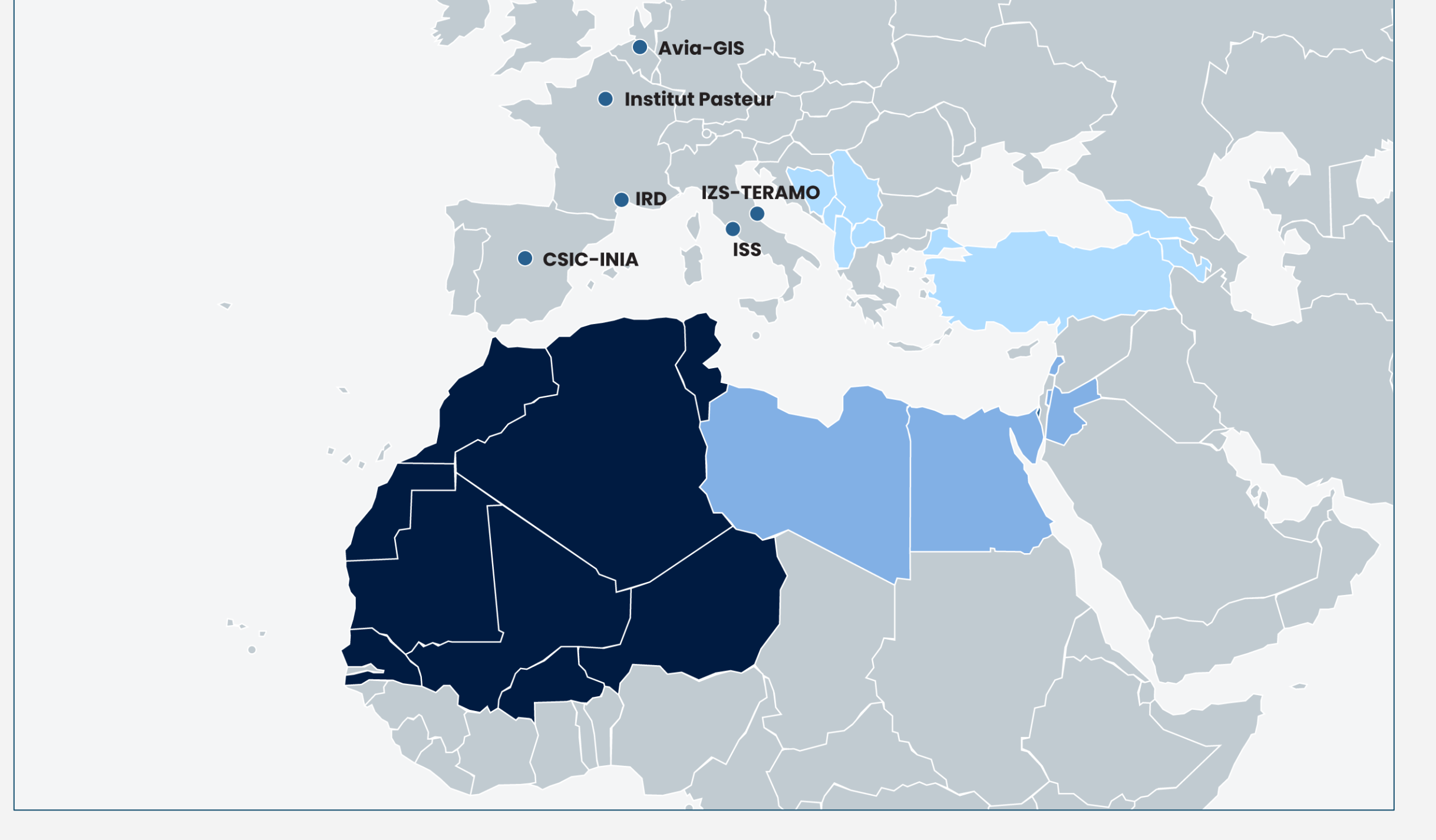
Fig. 1: The MLS Network (member countries in different shades of blue according to the region and partners represented with dots).

MediLabSecure (MLS) is a project funded by the European Commission that supports a network of 22 countries to strengthen and harmonize preparedness and response capacities to VBDs with a OH approach.